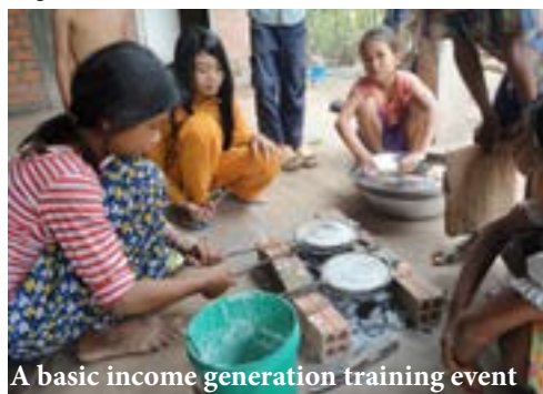
A basic income generation training event

World Education works to increase the effectiveness of local services for vulnerable youth over the long term through teacher, school management, and institutional capacity building. The program also develops more relevant curricula, improves monitoring and evaluation systems, and engages with the government at various levels. There are direct linkages to, and support for, implementation of relevant government policies, such as those on life skills, student councils, ICT, and the 2011 National Policy on Cambodia Youth Development. With support and training from World Education, all on-the-ground interventions are managed by either youth groups, student councils, or working groups made up of those with official mandates for protecting and educating youth in target communities.