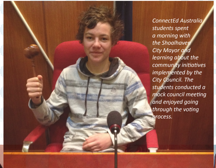
ConnectEd Australia students spent a morning with the Shoalhaven City Mayor and learning about the community initiatives implemented by the City Council. The students conducted a mock council meeting and enjoyed going through the voting process.

ConnectEd programs allowed youth to expand their sense of community from something broader than their immediate social group. In Australia,