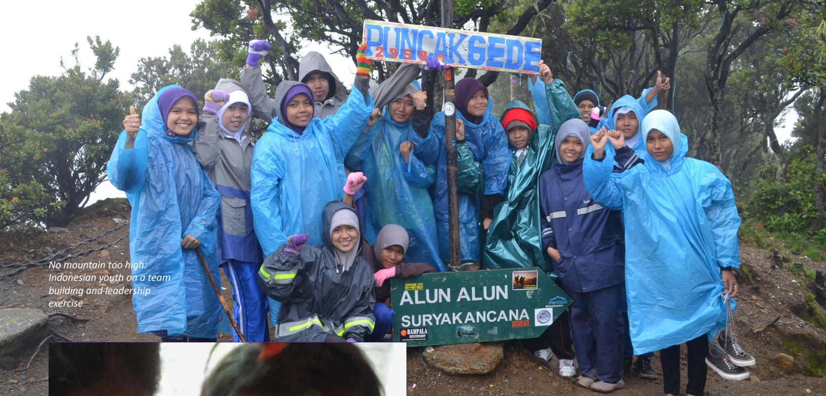
No mountain too high: Indonesian youth on a team building and leadership exercise