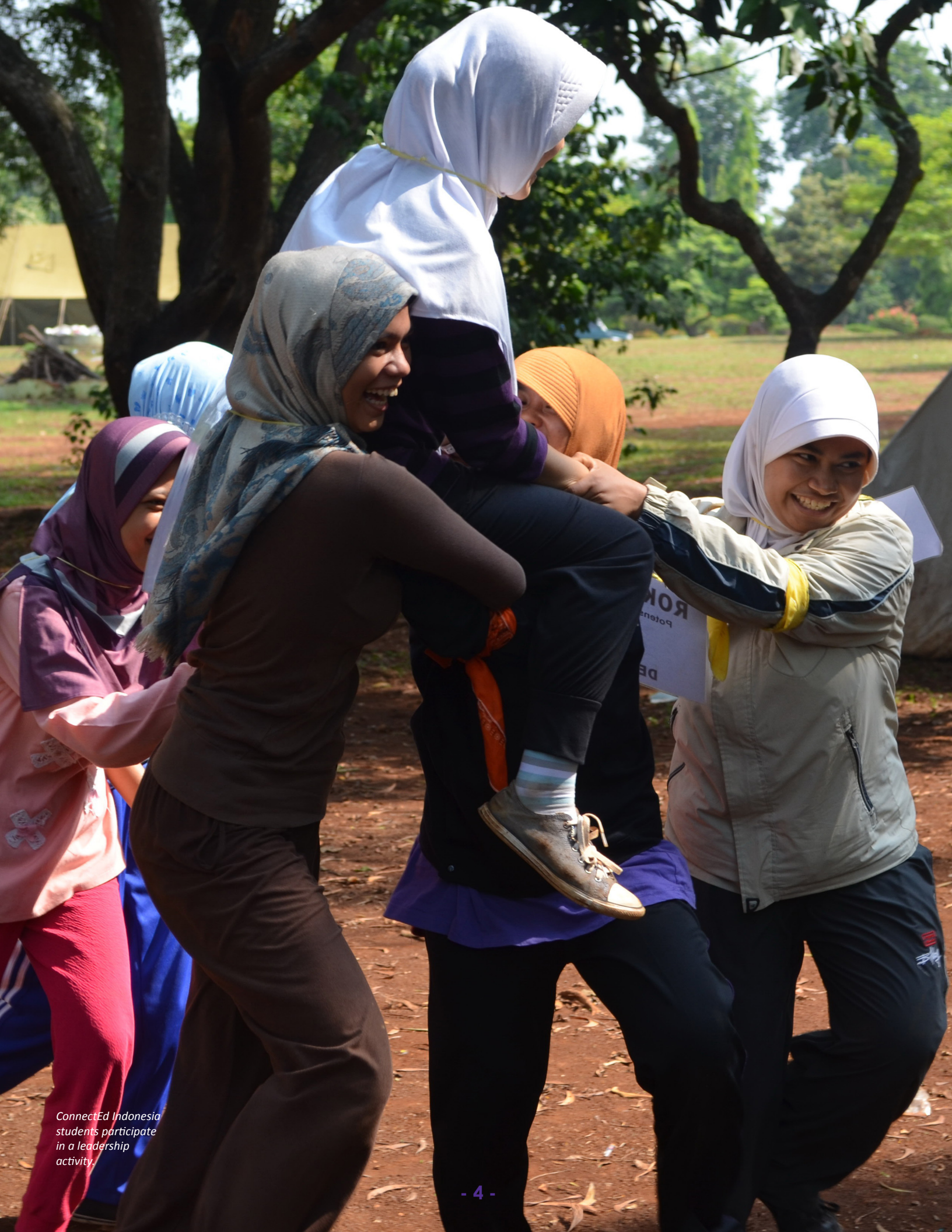
ConnectEd Indonesia students participate in a leadership activity.