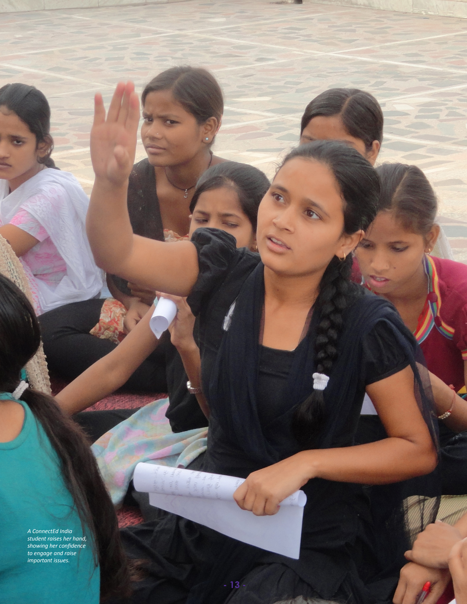
A ConnectEd India student raises her hand, showing her confidence to engage and raise important issues.