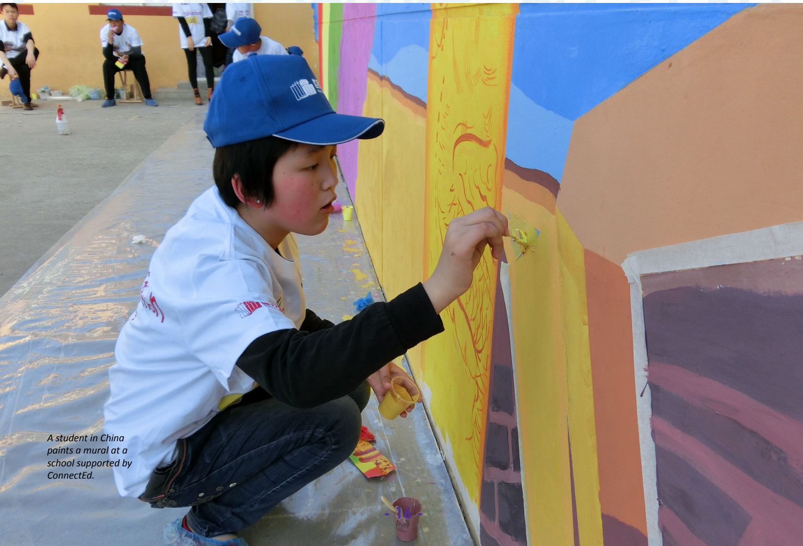
A student in China paints a mural at a school supported by ConnectEd.

BUT, CHANGE IS POSSIBLE, AND YOUTH THEMSELVES CAN BE THE BEST CATALYSTS FOR CHANGE