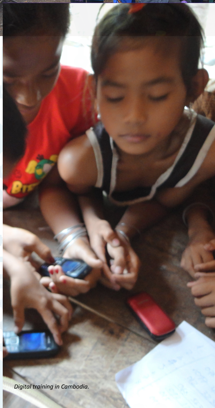
Digital training in Cambodia.

bonds and providing encouragement. From the start of their participation in ConnectEd, youth are given as many opportunities as possible to identify positively with school and learning, particularly through the use of ICT, performing arts workshops, sports and other community events.