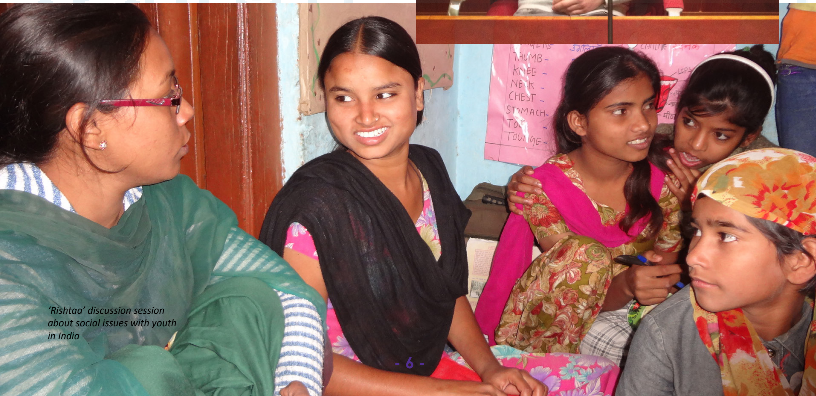
'Rishtaa' discussion session about social issues with youth in India