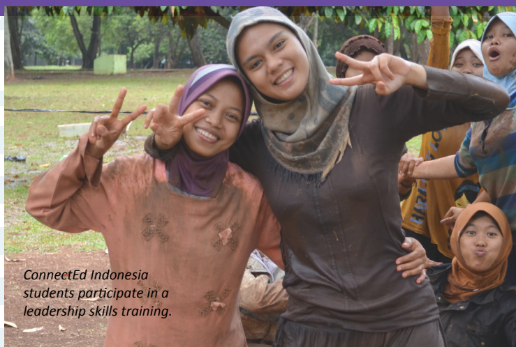
ConnectEd Indonesia students participate in a leadership skills training.

WATCH a video on the successes and life changes for 5 young women from Indonesia and India.