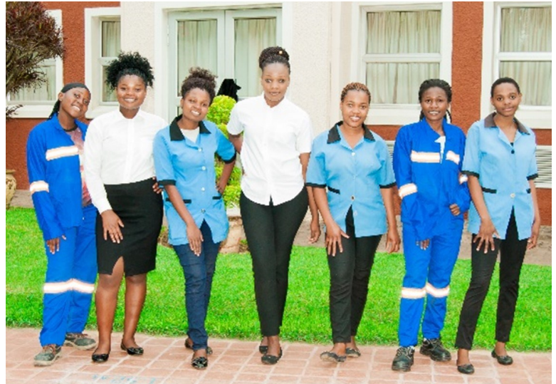
AGYW participating in Siyakha workforce readiness.

APA improves financial literacy of AGYW through Aflatoun/Aflateen/Aflayouth , an age-appropriate and participatory curriculum that helps AGYW hone their skills related to saving, budgeting, and income generation. Older AGYW who are engaged in income generating activities participate in Youth Village Savings and Loan Association (VSLA) groups that inculcate a savings discipline and promote budgeting and goal setting. Participation in Youth VLSAs strengthens self-efficacy decreases AGYW's reliance on transactional sex. To support AGYW in DREAMS who are too young to engage in economic activities, APA links their caregivers to adult VSLA groups. The Siyakha work force readiness program combines foundational, soft, and technical skills with practical internships and mentorship, and provides gender sensitive economic strengthening training, startup support, and coaching and mentoring to propel AGYW on the pathway to employment or entrepreneurship.